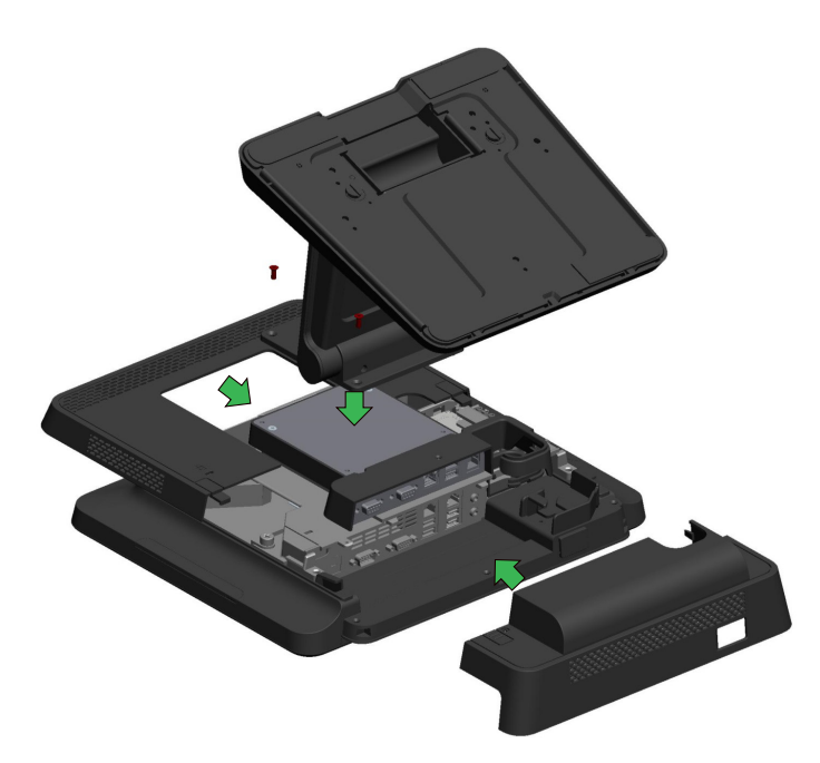
Reinstall cable cover, shield cover, and stand.